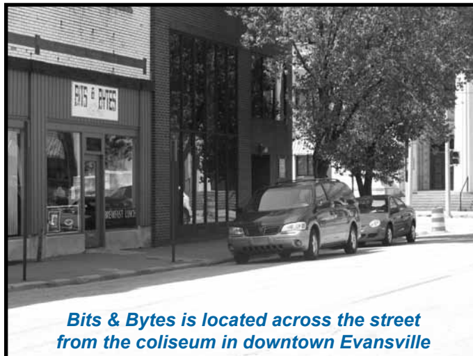
Bits & Bytes is located across the street from the coliseum in downtown Evansville