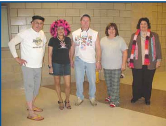
Evansville ARC Employees give examples to young job seekers of what not to wear to a job interview during the "Working Toward Your Future" Fall Conference and Career Style Show in October supported with The Arc of the United States and the Wal-Mart Foundation grant.