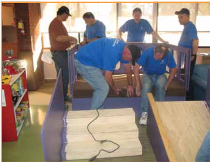
Alcoa volunteers finish one of two lofts they built for the Child Life Center in October. Funding for the project was provided by Alcoa and a donation from SABIC.

Proceeds from The Really Big Show benefit all programs at Evansville ARC!