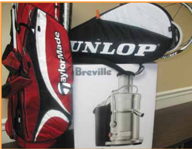
A few of the auction items already donated for the silent auction.