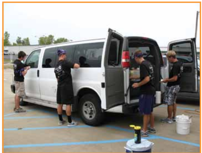
UE students detail client transportation vans at ARC Industries during the United Way Day of Caring in September. 71 volunteers participated in Day of Caring at Evansville ARC.